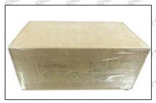
Pic No. 2 Domestic express packaging: Wrapped with Transparent tape

A Minors are prohibited from using transparent tape, yellow tape, black wrapping protective film, and white wrapping protective film to avoid personal injury.