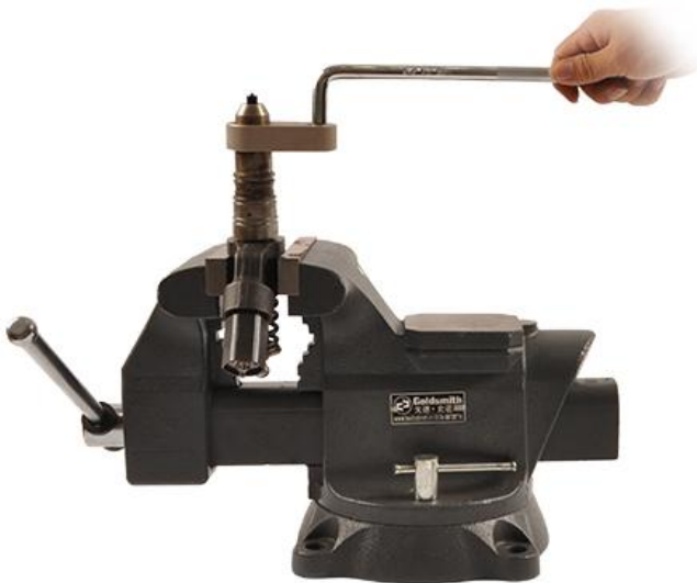
1. Remove the fuel injector