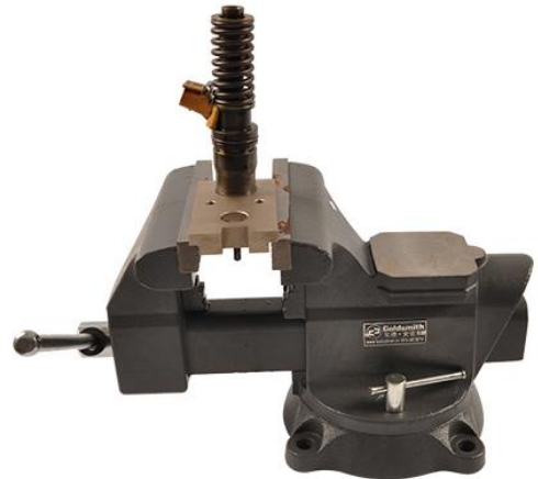
2. Fixed injector