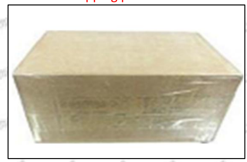
Pic No.1 Domestic express packaging: Wrapped by Transparent tape

Minors are prohibited from using transparent tape, yellow tape, black wrapping protective film, and white wrapping protective film to avoid personal injury.