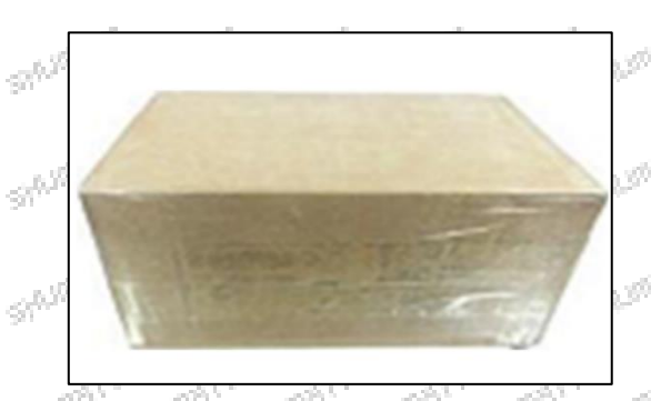
Pic No. 1 Domestic express packaging: Wrapped by Transparent tape

Minors are prohibited from using transparent tape, yellow tape, black wrapping protective film, and white wrapping protective film to avoid personal injury.