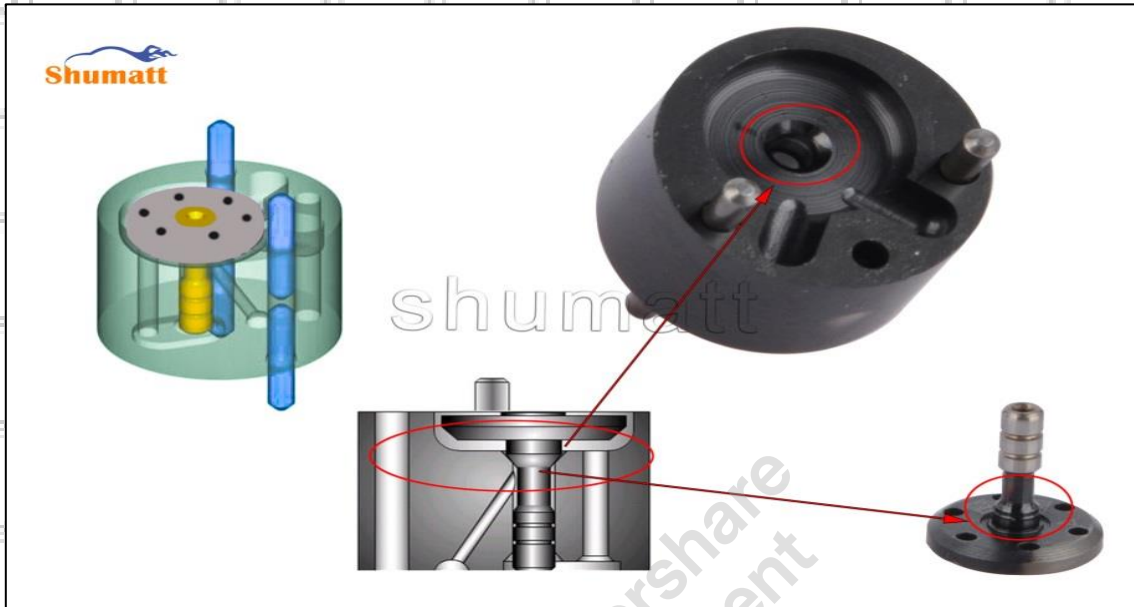
Pic No. 1