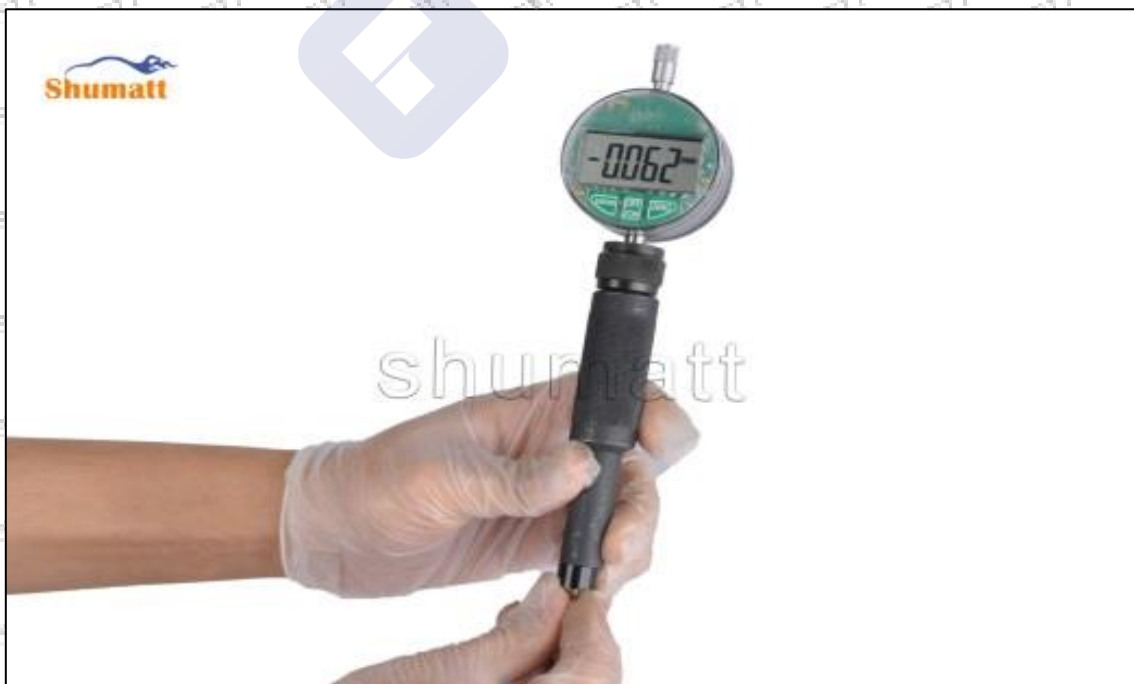
Pic No. 2