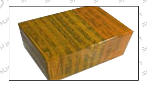
Pic No. 2 International express packaging: Wrapped with yellow tape after wrapping black protective film

Mob/WhatsApp: +86 13410541523 Tel: +8675523215133