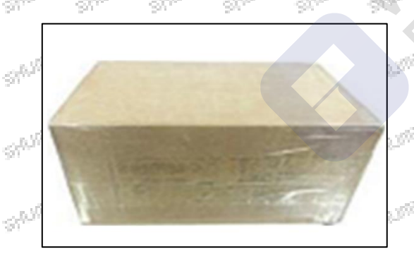
Pic No. 1 Domestic express packaging: Wrapped by Transparent tape

A Minors are prohibited from using transparent tape, yellow tape, black wrapping protective film, and white wrapping protective film to avoid personal injury.