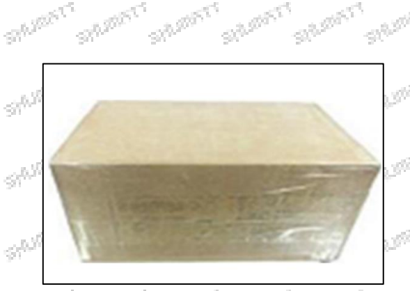
Pic No. 1 Domestic express packaging: Wrapped by Transparent tape

Minors are prohibited from using transparent tape, yellow tape, black wrapping protective film, and white wrapping protective film to avoid personal injury.