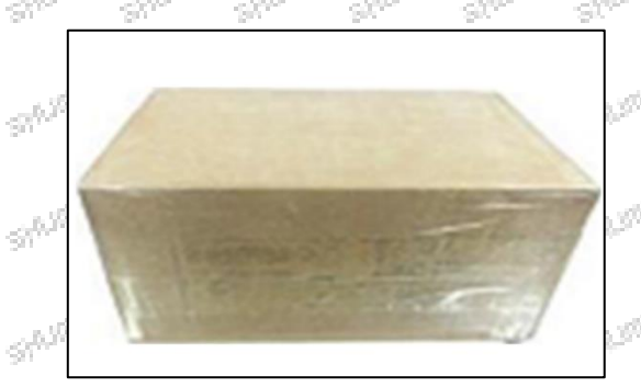
Pic No. 1 Domestic express packaging: Wrapped by Transparent tape

Minors are prohibited from using transparent tape, yellow tape, black wrapping protective film, and white wrapping protective film to avoid personal injury.