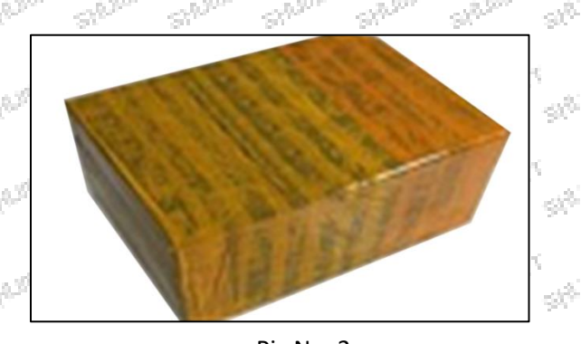
Pic No. 2 International express packaging: Wrapped with yellow tape after wrapping black protective film