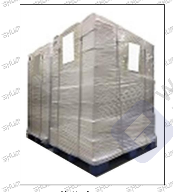
Pic No. 3

Pallet Shipping: Use pallet that meet export requirements, and use white wrapping protective film to wrap and bind with cable ties