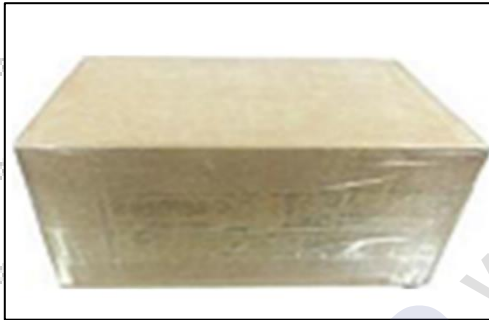
Pic No. 1

▲ Minors are prohibited from using transparent tape, yellow tape, black wrapping protective film, and white wrapping protective film to avoid personal injury.