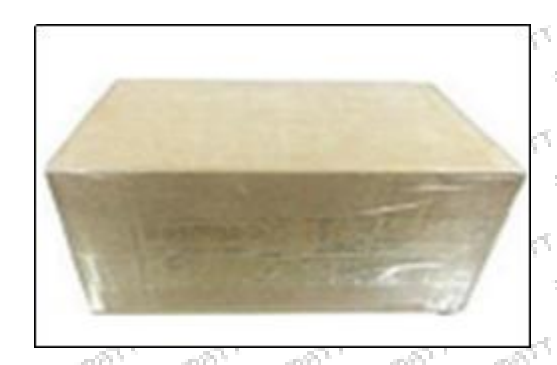
Pic No. 2 Domestic express packaging: Wrapped by Transparent tape

A Minors are prohibited from using transparent tape, yellow tape, black wrapping protective film, and white wrapping protective film to avoid personal injury.