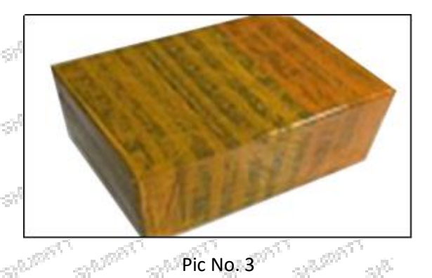
International express packaging: Wrapped with yellow tape after wrapping black protective film

Mob/Whatsapp: +86 13410541523 Tel: +8675523215133