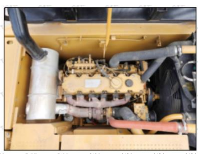
Matching Car Model: Caterpillar 320D excavator