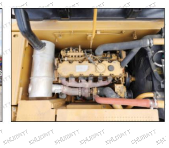
Matching Car Model: Caterpillar 320D excavator