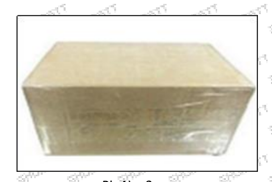
Pic No. 2 Domestic express packaging: Wrapped by Transparent tape

Minors are prohibited from using transparent tape, yellow tape, black wrapping protective film, and white wrapping protective film to avoid personal injury.