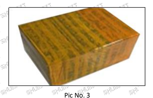
International express packaging: Wrapped with yellow tape after wrapping black protective film