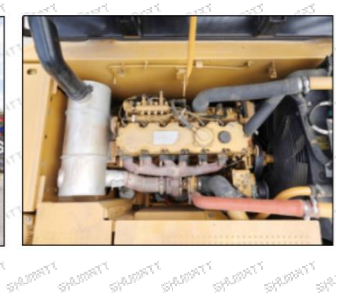
Matching Car Model: Caterpillar 320D excavator