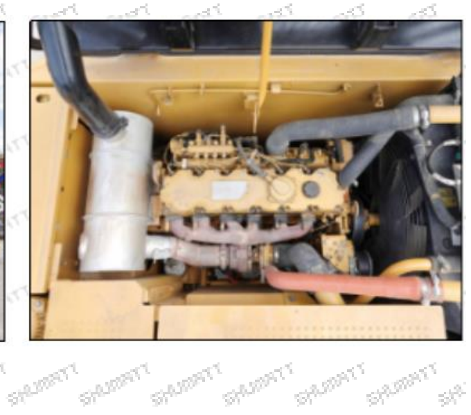
Matching Car Model: Caterpillar 320D excavator