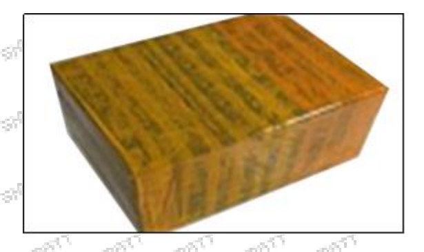
Pic No. 3 International express packaging: Wrapped with yellow tape after wrapping black protective film

Mob/Whatsapp: +86 13410541523 Tel: +8675523215133