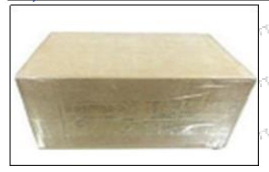
Pic No. 2 Domestic express packaging: Wrapped by Transparent tape