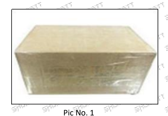
Domestic express packaging: Wrapped by Transparent tape

A Minors are prohibited from using transparent tape, yellow tape, black wrapping protective film, and white wrapping protective film to avoid personal injury.