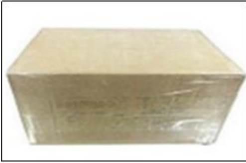
Pic No. 1