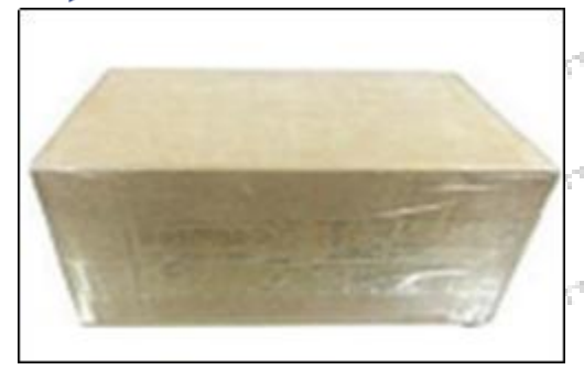
Pic No. 1 Domestic express packaging: Wrapped by Transparent tape