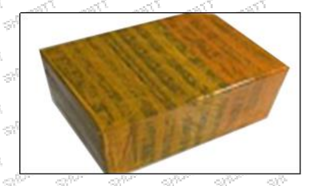
Pic No. 3 International express packaging: Wrapped with yellow tape after wrapping black protective film 1000