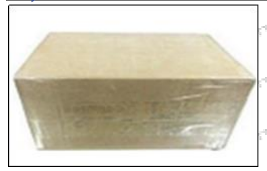
Pic No. 2 Domestic express packaging: Wrapped by Transparent tape