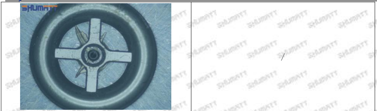
The wear of the middle oil back-flow hole causes gap between semi ball and orifice plate, and causes the orifice plate to be washed out by high-pressure oil