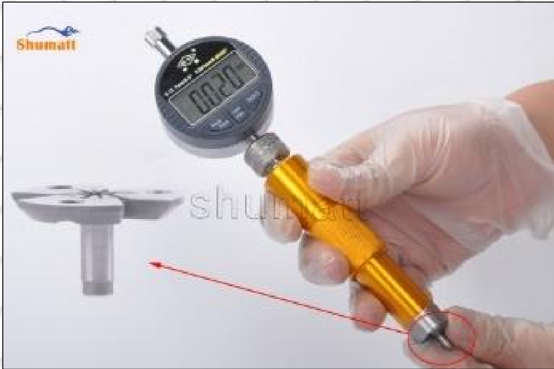
Pic No. 7

(8) The measurement of air clearance is in the normal range, within 45-50 (um) microns, see as Pic No. 7