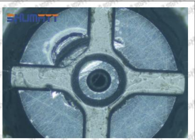
Marks of the misalignment of the semi ball