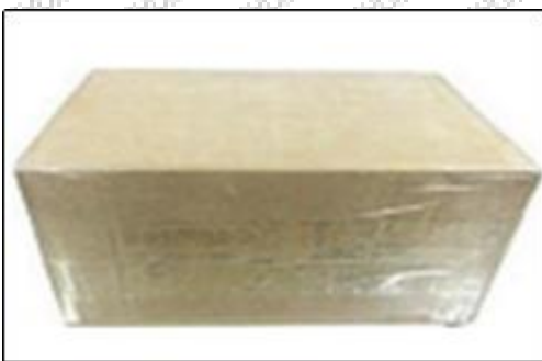
Pic No. 1