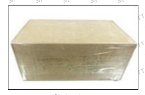
Pic No. 1 Domestic express packaging: Wrapped by Transparent tape

A Minors are prohibited from using transparent tape, yellow tape, black wrapping protective film, and white wrapping protective film to avoid personal injury.