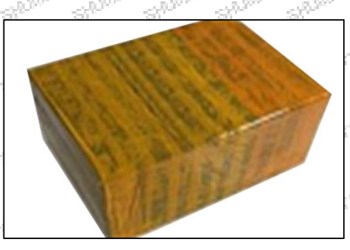
Pic No. 2 International express packaging: Wrapped with yellow tape after wrapping black protective film