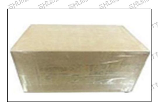
Pic No. 1 Domestic express packaging: Wrapped with Transparent tape

white wrapping protective film to avoid personal injury.