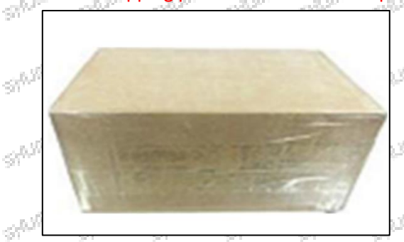
Pic No. 1 Domestic express packaging: Wrapped by Transparent tape