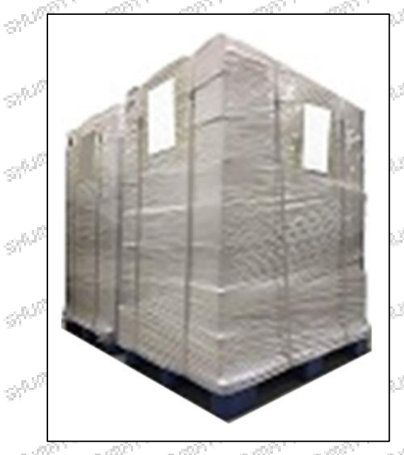
Pic No. 3

Pallet Shipping: Use pallet that meet export requirements, and use white wrapping protective film to wrap and bind with cable ties