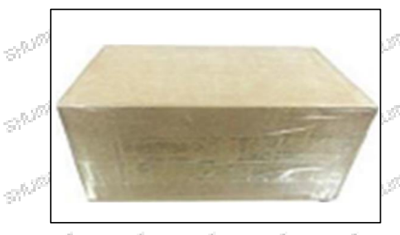
Pic No. 1 Domestic express packaging: Wrapped with Transparent tape