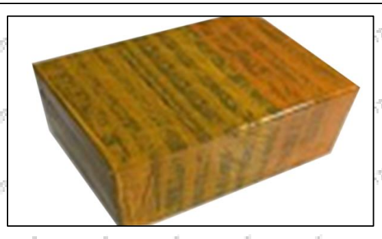
Pic No. 2 International express packaging: Wrapped with yellow tape after wrapping black protective film