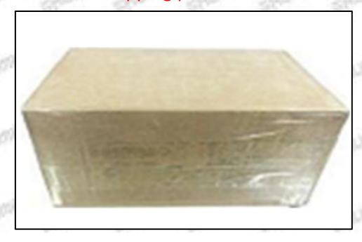
Pic No. 2 Domestic express packaging: Wrapped with Transparent tape

Minors are prohibited from using transparent tape, yellow tape, black wrapping protective film, and white wrapping protective film to avoid personal injury.