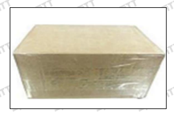
Pic No. 1

⚠ Minors are prohibited from using transparent tape, yellow tape, black wrapping protective film, and white wrapping protective film to avoid personal injury.