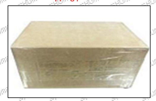
Pic No. 1 Domestic express packaging: Wrapped with Transparent tape

A Minors are prohibited from using transparent tape, yellow tape, black wrapping protective film, and white wrapping protective film to avoid personal injury.