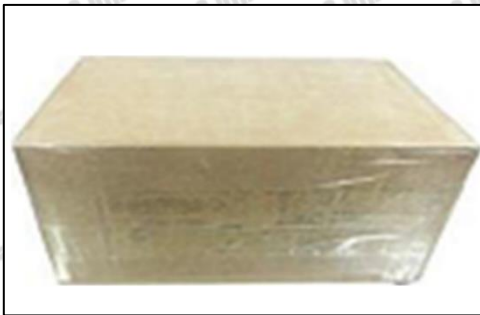
Pic No. 1

⚠ Minors are prohibited from using transparent tape, yellow tape, black wrapping protective film, and white wrapping protective film to avoid personal injury.