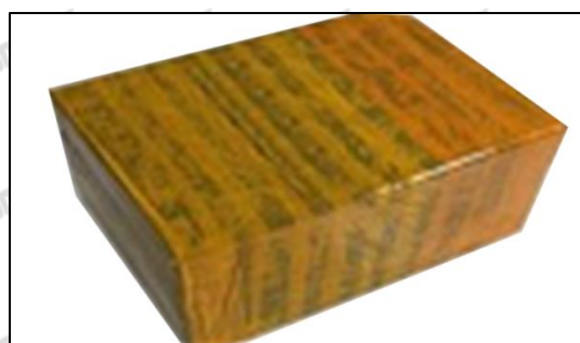
Pic No. 2