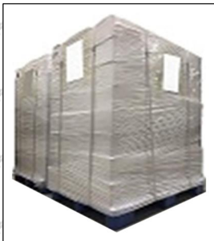
Pic No. 3

Wrapped with yellow tape after wrapping black protective film